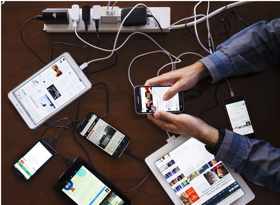
Three decades ago, the round-the-clock political information and access that we enjoy today was unimaginable.