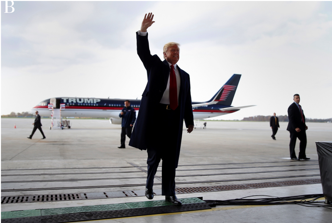
President-elect Donald Trump at a campaign event in Wilmington, Ohio days before the election. Trump won the battleground state, helping to deliver him the presidency.

As editor of Politico throughout this never-to-be-forgotten campaign, I've been obsessively looking back over our coverage, too, trying to figure out what we missed along the way to the upset of the century and what we could have done differently. (An early conclusion: while we were late to understand how angry white voters were, a perhaps even more serious lapse was in failing to recognize how many disaffected Democrats there were who would stay home rather than support their party's flawed candidate.) But journalistic handwringing aside, I still think reporting about American politics is better in many respects than it's ever been.