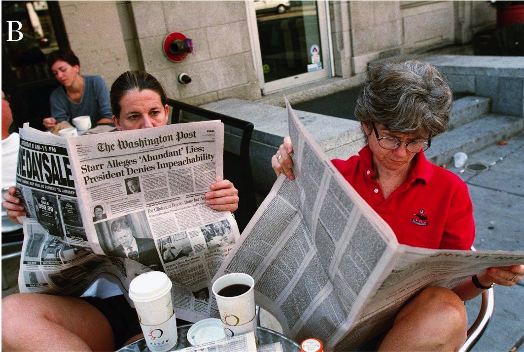
People read the September 12, 1998 edition of The Washington Post . That day's paper featured a special section comprising the complete 41,000-word Starr Report on President Clinton.

The old presses shook the Post building starting around 10 p.m. each night just as they had for decades, and sometimes, if the news was big, as it often was during the 13 long months of the Lewinsky scandal, there would be a line of people waiting in front when the first edition came out around midnight. The nightly 6 p.m. front-page meetings in the old conference room with the framed "Nixon Resigns" headline staring down at us were taken very seriously, and the feverish lobbying for a spot on that page was an indication of how much we were all convinced it mattered. Although we had a website by then and published our articles on it each night, the national editors of the Post still trusted the more ancient methods of finding out what the competition was up to: at 9 p.m., the news aide in the New York bureau would be patched through on speakerphone as she held up her receiver to the radio, so that we could hear the announcer on the New York Times -owned WQXR radio station reading out the early headlines from the next day's Times . When the Starr report finally came out in September of 1998, we printed the entire thing—all 41,000 words—as a special section in the next day's newspaper, and the only debate I recall was not whether we should make such a sacrifice of trees when the whole thing was available online but whether and if to edit out any of the more overtly R-rated parts of the report on the president and his twenty-something girlfriend's White House antics.