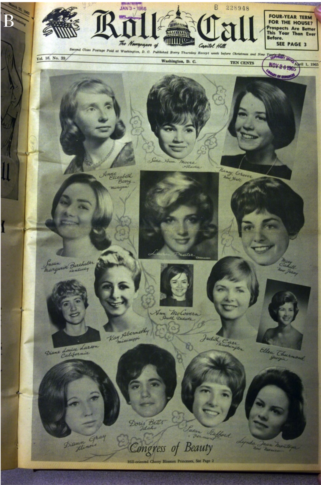
A 1965 edition of Roll Call featured "Congress of Beauty." Roll Call began life as a weekly tabloid detailing the news and gossip of Capitol Hill. It now reports on legislative and political activity in Washington, DC and around the nation.