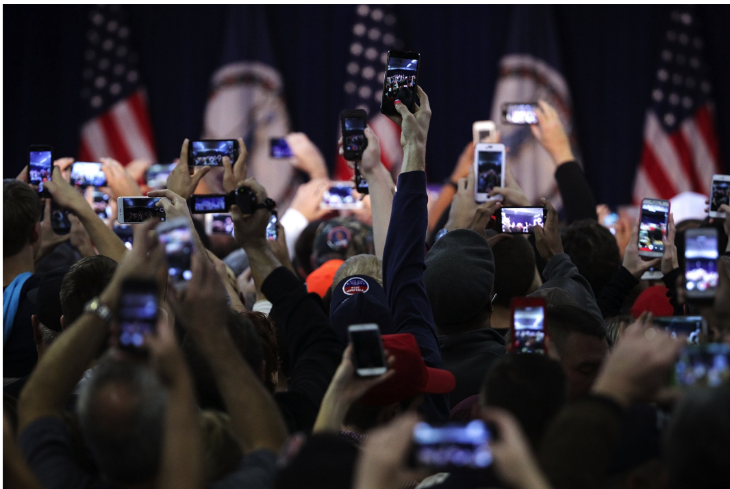
Donald Trump supporters hold up their phone cameras as they wait for the Republican presidential nominee to arrive at a campaign rally in Manassas, Virginia.

But it’s hard not to have experienced The Trump Show and all that’s gone along with it without having some major new qualms.