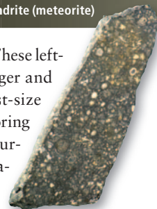
▶ Chondrite (meteorite)