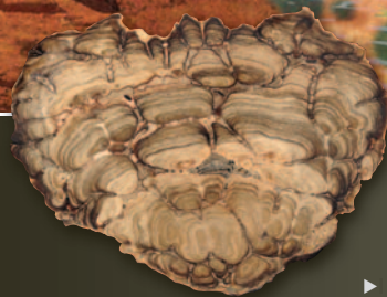
◀ Fossil stromatolite cross section

2 BILLION YEARS AGO: Photosynthetic living organisms have given Earth's atmosphere a small percentage of oxygen, dramatically altering its chemical action. Ferrous ( \text{Fe}^{2+} ) iron minerals common in black basalt are oxidized to rust-red ferric ( \text{Fe}^{3+} ) compounds. This "Great Oxidation Event" paves the way for more than 2,500 new minerals, including rhodonite (found in manganese mines) and turquoise. Microorganisms ( green ) lay down sheets of material called stromatolites, made of minerals such as calcium carbonate.