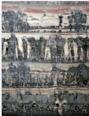
▲ Cap carbonate

Life’s earliest manifestations—primitive single-celled organisms that “fed” on the chemical energy of rocks—cannot have had much effect on Earth’s mineralogical diversity. To be sure, geologists have found biologically mediated rock formations dating back to 3.5 billion years ago, including reefs made of calcium carbonate and so-called banded iron formations (in which iron oxides apparently lock away the first oxygen produced by life). But the land was still barren, the atmosphere at large still lacked oxygen, surface weathering was slow, and the earliest life contributed almost nothing to alter the number of minerals present or their distribution.