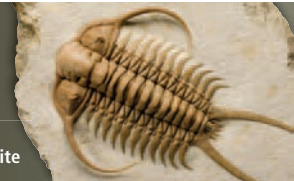
► Fossil trilobite

pounds. From space, Earth's continents two billion years ago might have looked something like Mars, albeit with blue oceans and white clouds providing dramatically colorful contrasts.