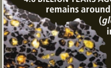
◀ Olivine crystals in pallasite (meteorite)

4.6 BILLION YEARS AGO: Millions of planetesimals form in the disk of dust and gas that remains around the recently ignited sun (in background) and collide to form Earth (glowing planet). More than 200 minerals, including olivine and zircon, develop in the planetesimals, thanks to melting of their material, shocks from collisions, and reactions with water. Many of these minerals are found in ancient chondritic meteorites.