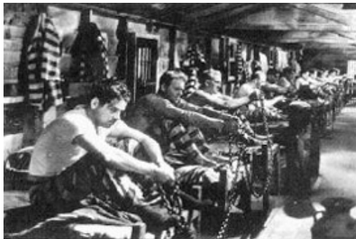
I Am a Fugitive from a Chain Gang

These accounts propose an odd, hybrid history, suggesting that movie genres have their own